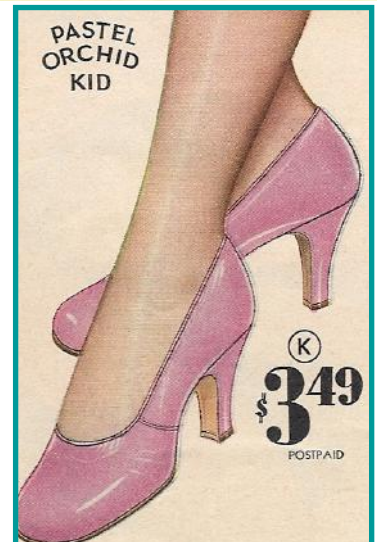
Hat and shoe from a 1931 National Bellas Hess catalog.