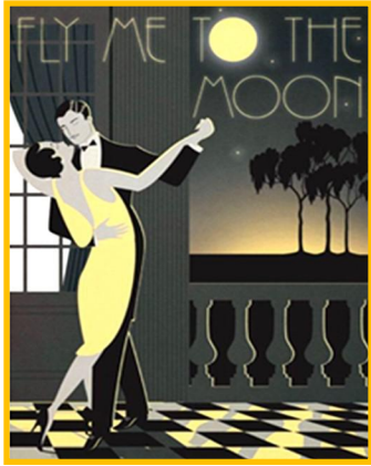
The bar was a popular place...